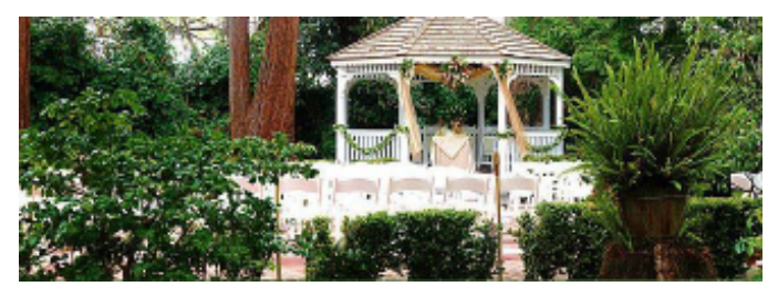
On the grounds of Rockefeller Lodge.

September 12, 2019, the Annual Gala Dinner/Fundraiser at Rockefeller Lodge, 2650 Market Ave. San Pablo, CA. 5:30 - 9:30 p.m. (See flyer, previous page and article, p. 1.)