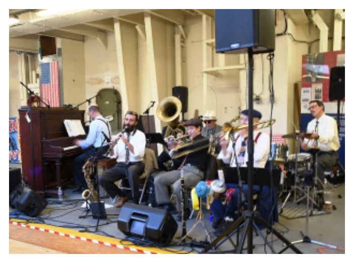
The Silver Bell Jazz Band performs at Swing on the Ship aboard the Red Oak Victory.