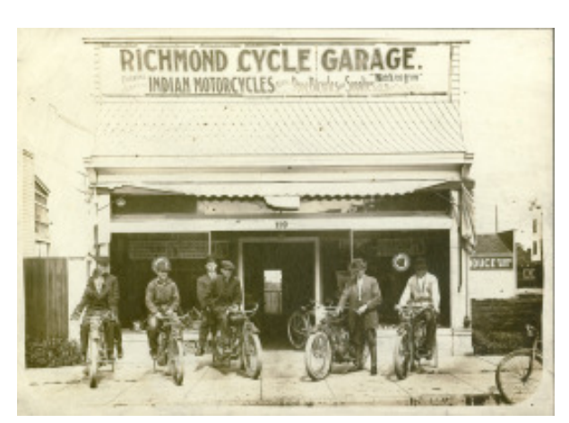
This photograph, ca. 1915, is an example of what will be on display in "Richmond in Focus."

Photography is fundamentally a tool to document how life changes. Our goal in this exhibit is to demonstrate how the physical landscape of Richmond has transformed as well as the important social changes that have taken place. The Museum released a call for Richmond-themed original photos and received over 100 images from about 30 living artists. We are excited to have the unique opportunity to pair modern and historical photographs that will showcase Richmond over time.