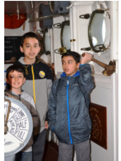
HEARTS students on ROV Bridge sounding the Ship's horn.