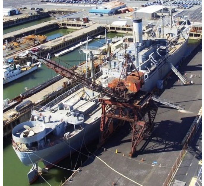
Aerial view of the ROV and whirley crane at Shipyard No. 3.

pump and so on. So it is with the ROV; there are a lot of complicated steps, procedures and trials that have to be undertaken in order to "start her up." The great news is