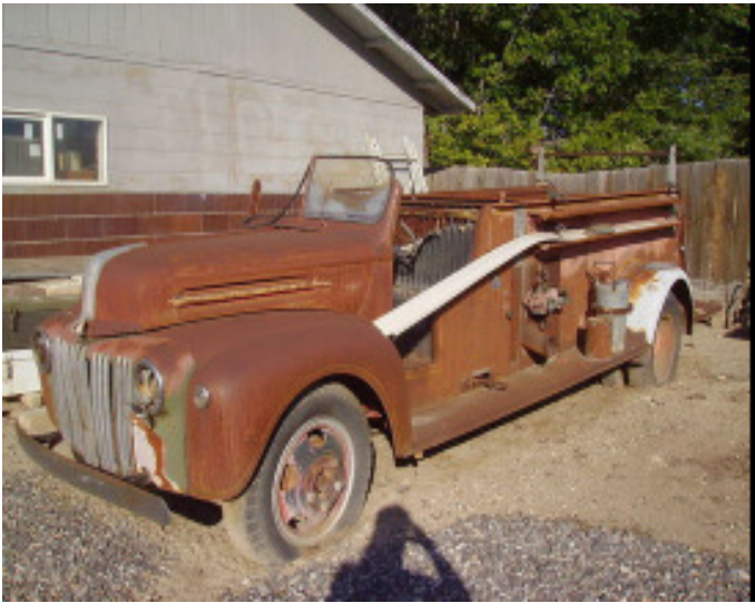
Richmond Shipyard No. 3 fire truck as found in Utah.