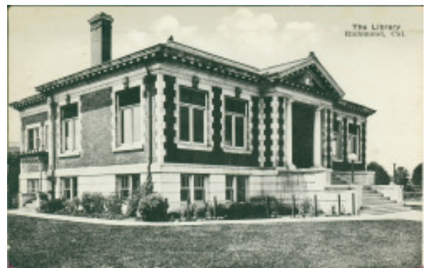
The Carnegie Library ca. 1910 at 4th Street and Nevin Ave., currently the site of the Richmond Museum of History.