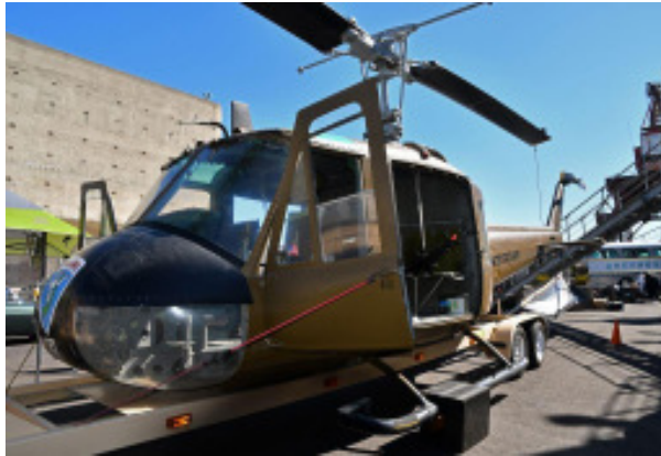
Vietnam-era "Huey" helicopter displayed by the Vietnam Helicopter Pilots Association on Veterans Day.